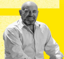
DARREN LEHMANN AUSTRALIAN CRICKET LEGEND